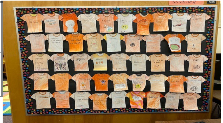
False Creek participated in Orange Shirt Day / National Day for Truth and Reconciliation.